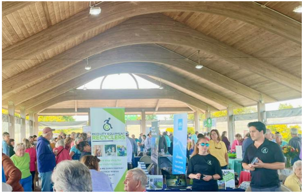
The Jamestown Senior Center had over 500 people attend our first ever Aging in Place Resource Fair with over 40 vendors.

*Hearing tests will be hosted in the conference room at the Town Hall