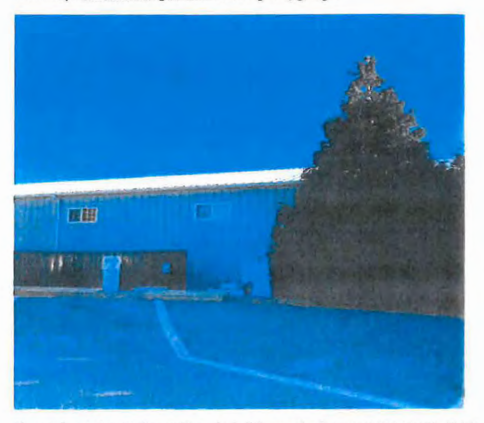
Photo taken behind police station of a building on the former CMS property. This is an example of the siding and roofing color for the proposed new workshop.