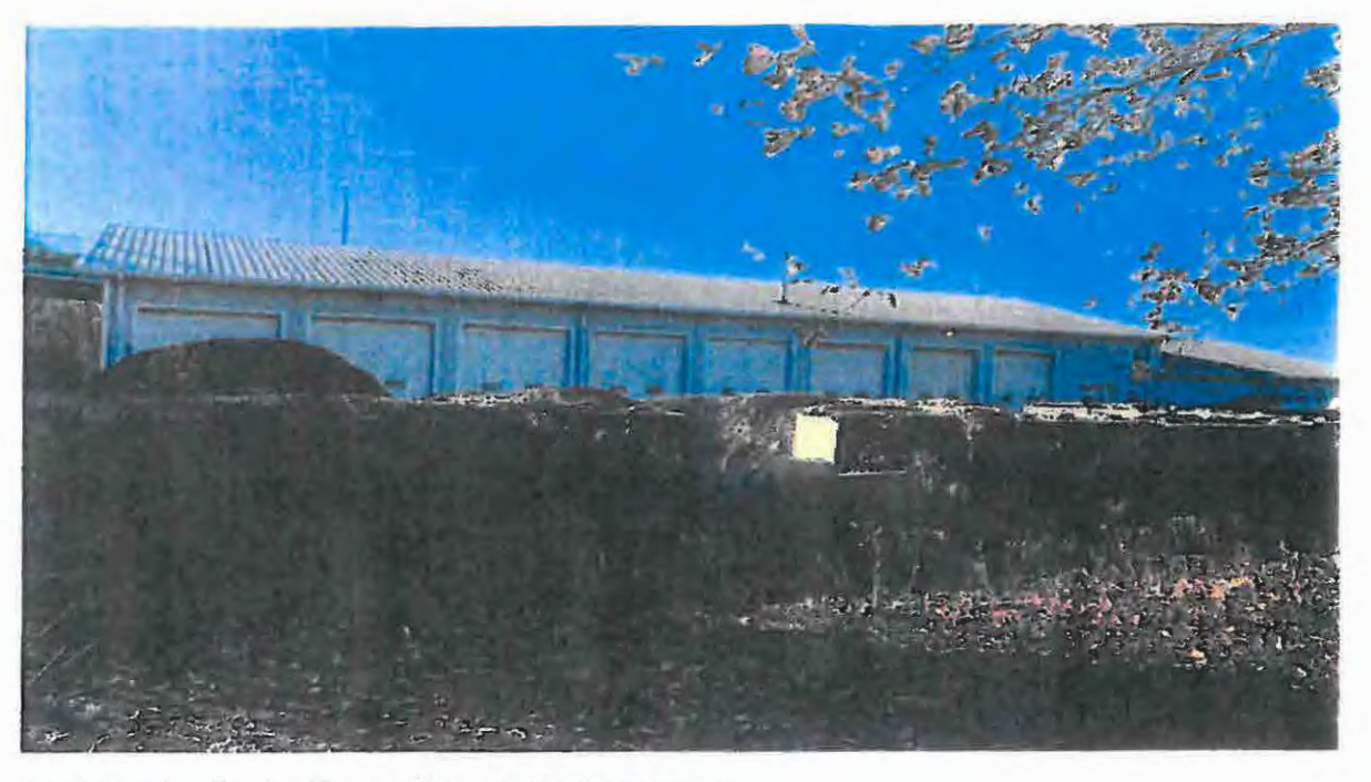
Workshop location looking south toward highway garage.