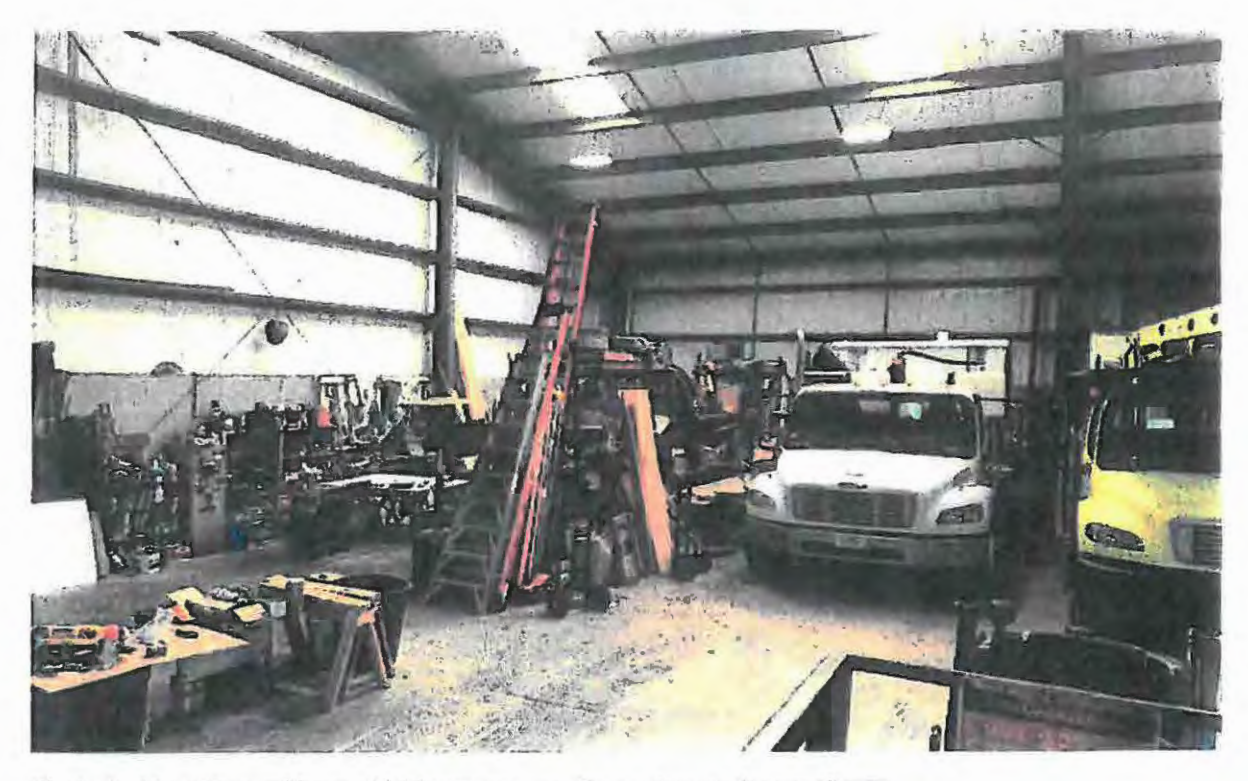
Photo inside unheated bays of highway garage. Carpenter work area shown