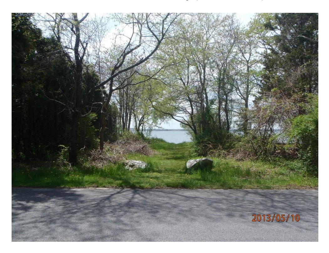
Grassy Path with minimum slope to shoreline. Path Maintained by Abutters.