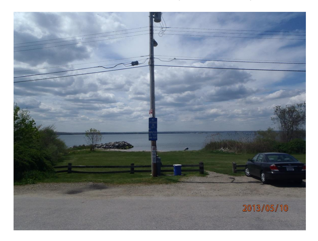
Beach Maintained by Recreation Department. Residency Sticker Required for Summer Parking