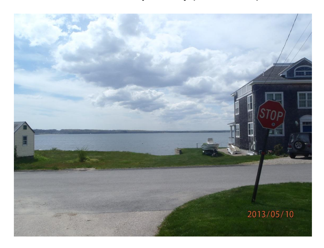
Grassy Path slopes to concrete boat ramp