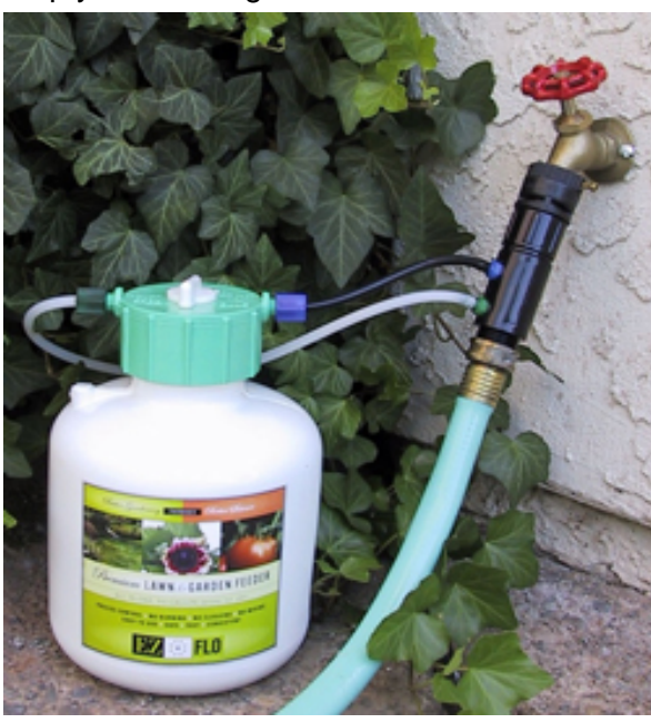
The most common Cross-Connection is a garden hose.

Help us protect your drinking water supply from accidental pollution. We encourage you to learn more about cross-connections, what you can do to prevent water backflow and keep your drinking water clean and safe.