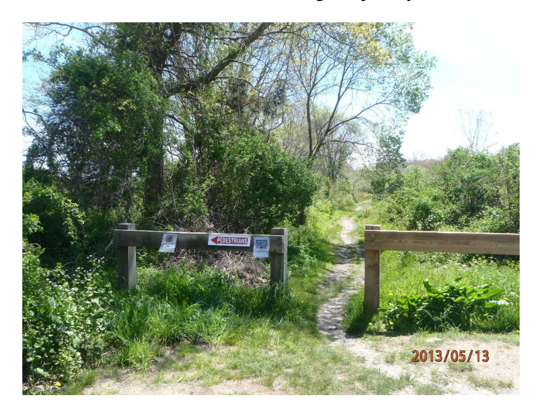
View from Beavertail Rd Parking Area