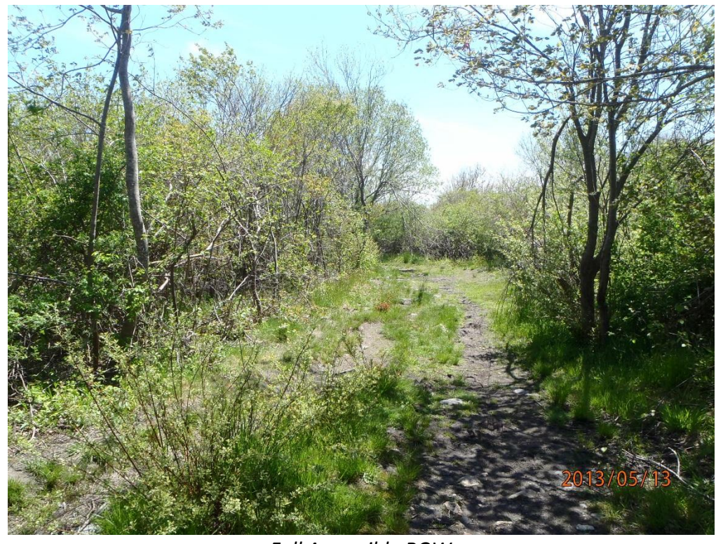
Full Accessible ROW