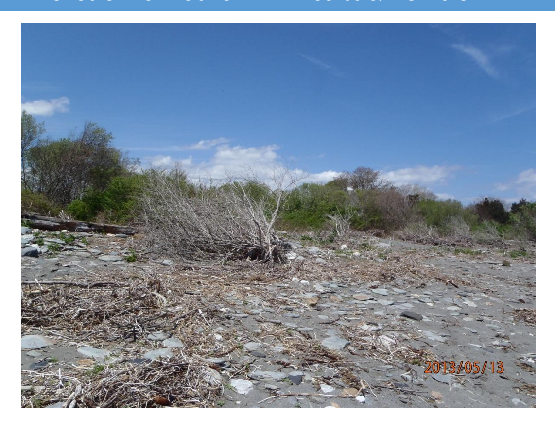
The Cove is surrounded by rock outcroppings and consists of a sand and cobble beach