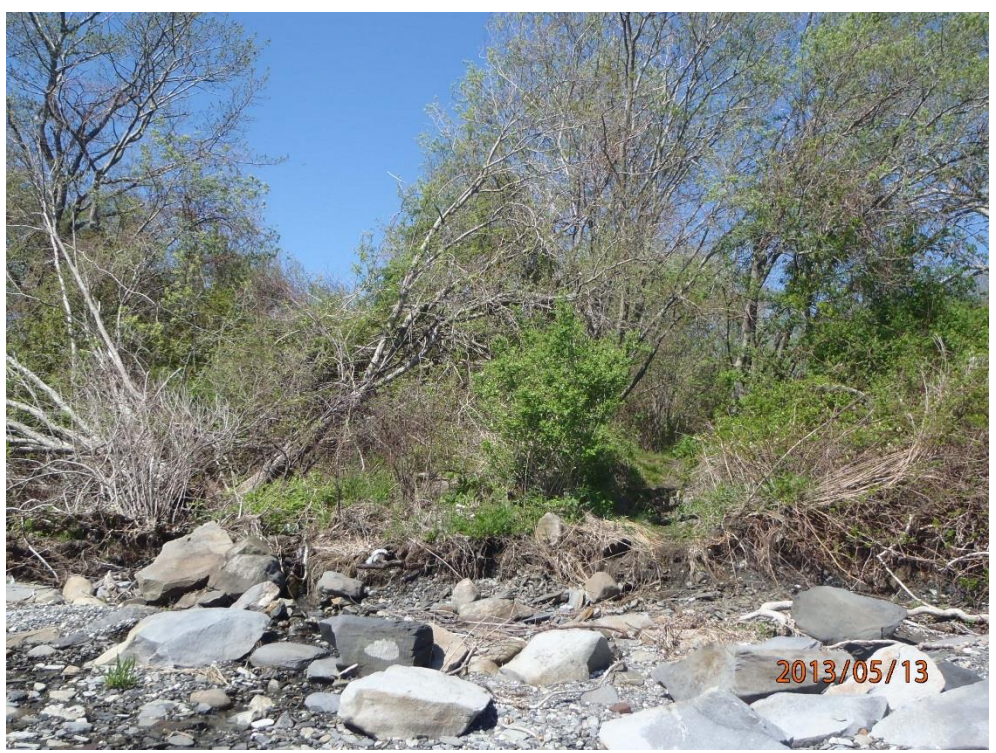
Westerly View from Shoreline