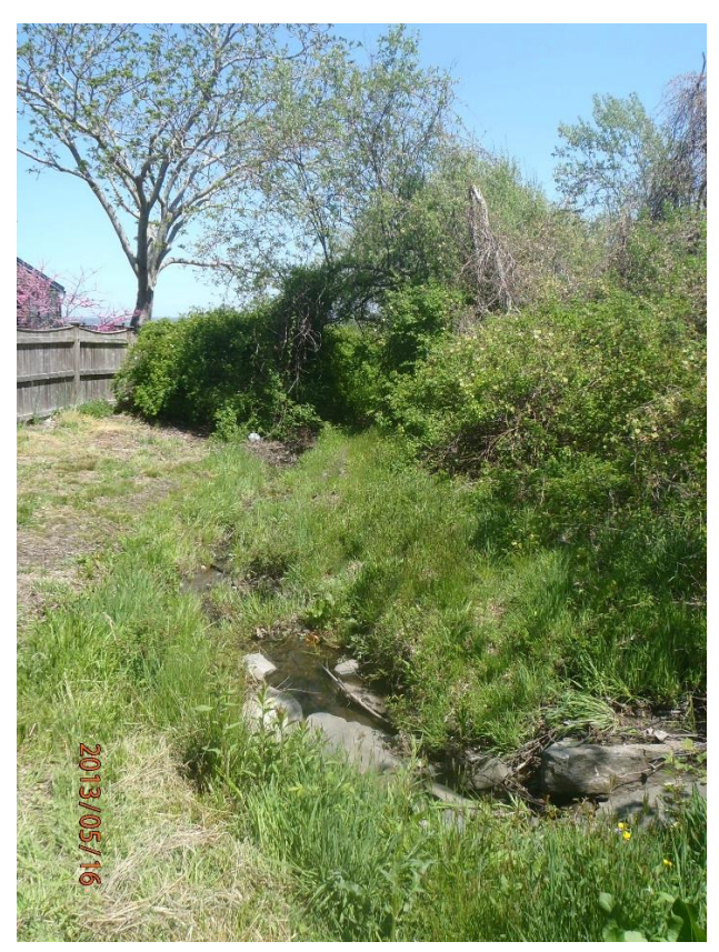
Intermittent Stream along overgrown pathway