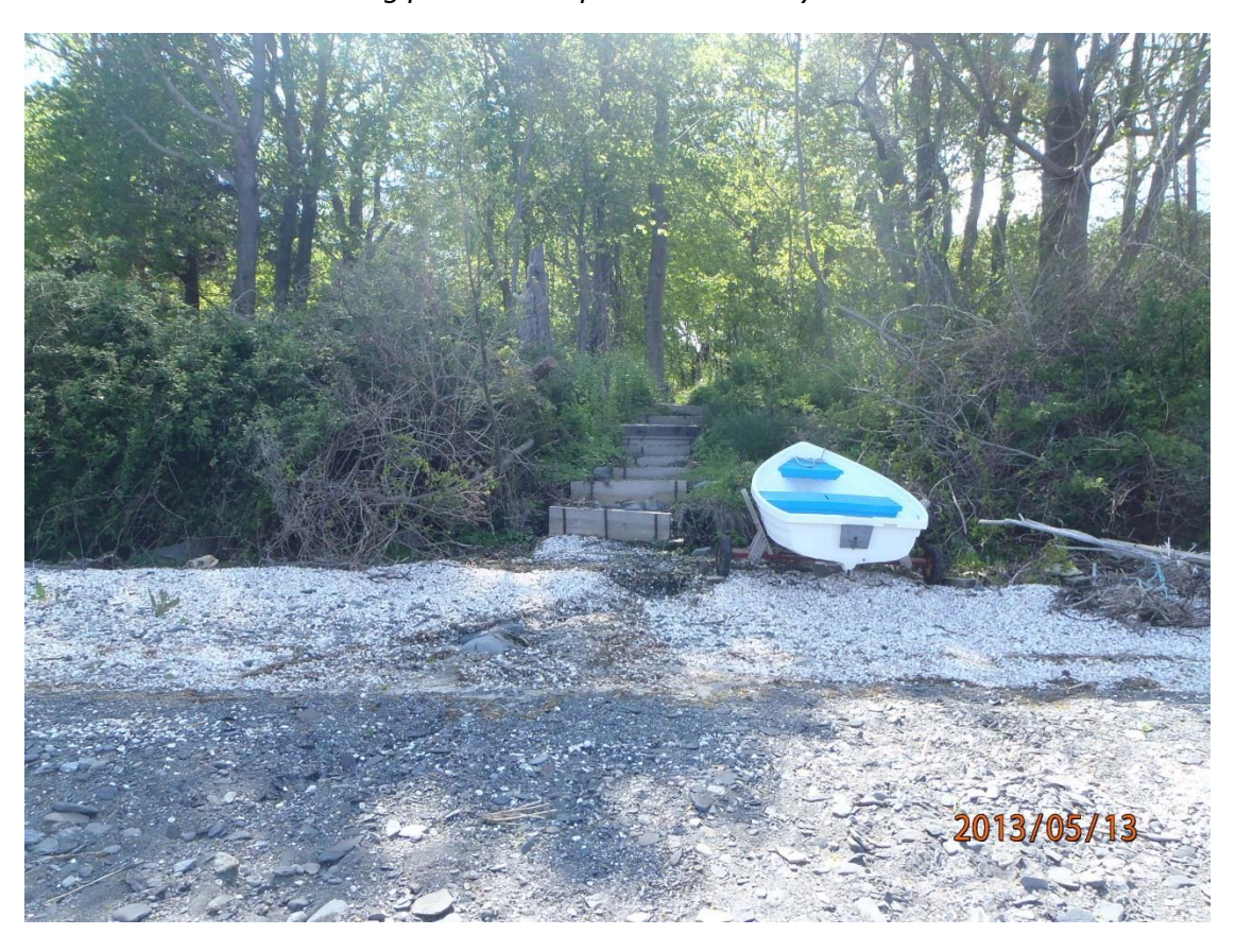
Westerly View from Shoreline