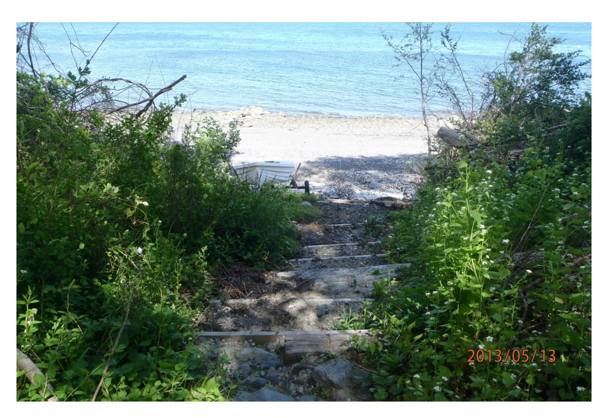
Existing path and steps maintained by abutters