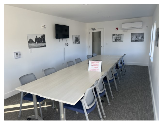
Great Room - Presentation Setup