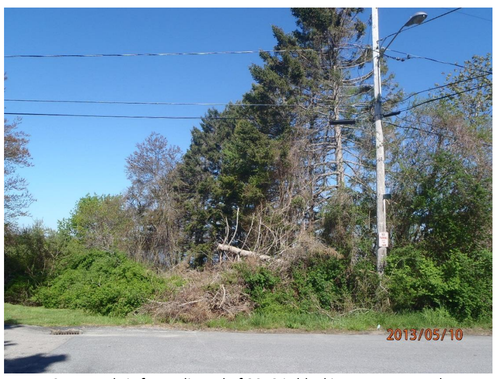
Storm Debris from Blizzard of 2013 is blocking access to path