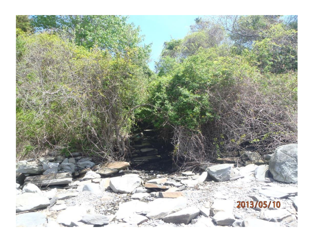
Open path maintained by abutters abruptly ends at outfall pipe and dangerous 20 foot drop. Stormwater outfall pipe is about 20 feet in from shoreline