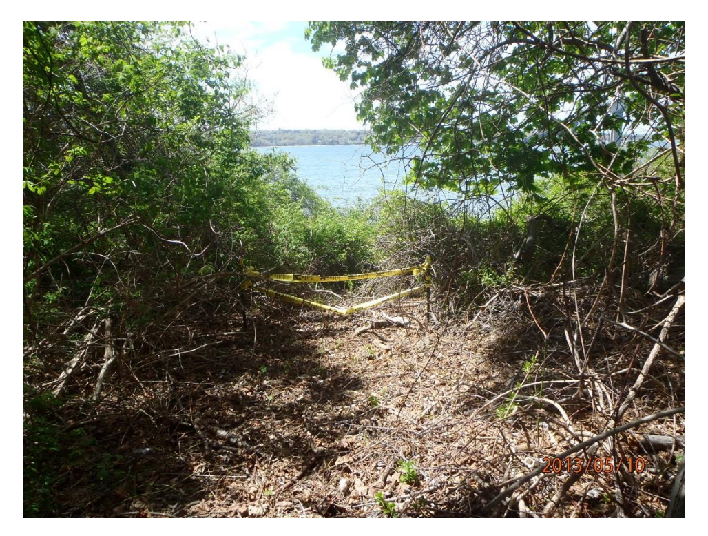
Caution Tape at end of path before Outfall Pipe Dropoff