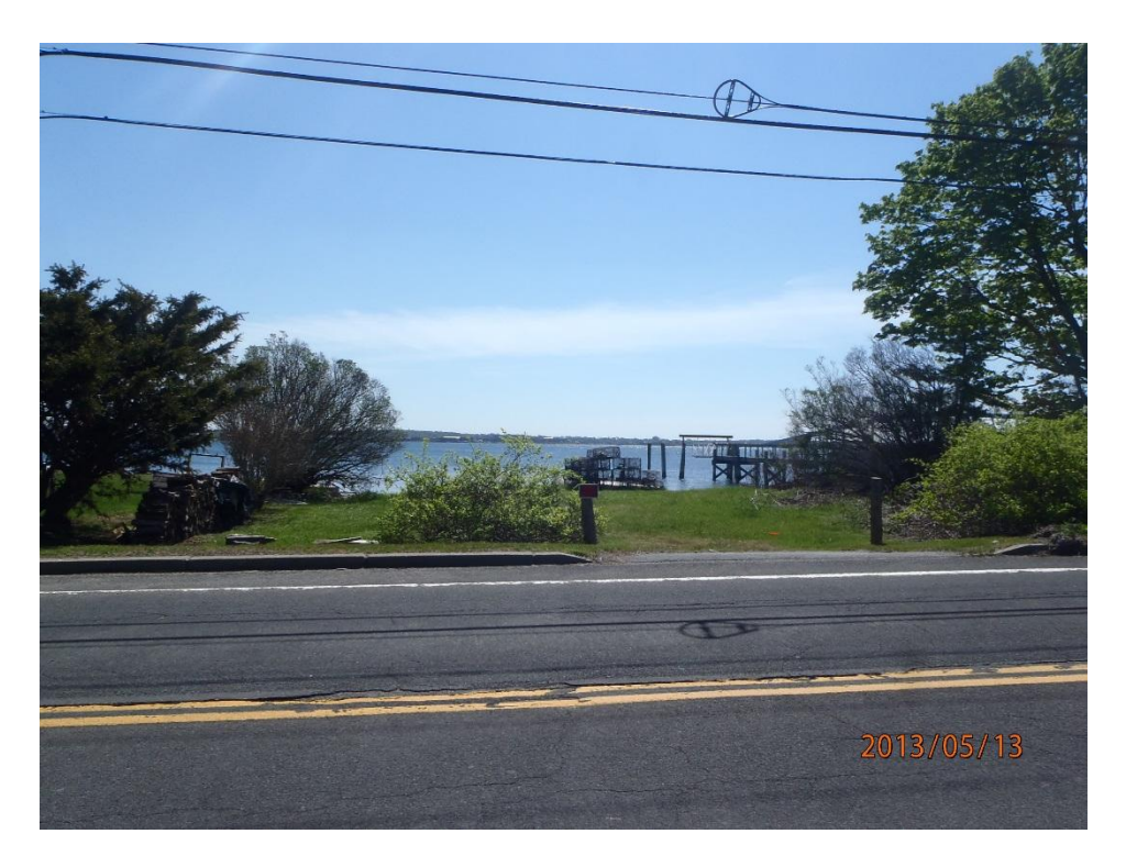
Site #20: East Shore Rd Park ~ Plat 7 Lot 217

Narragansett Park Subdivision Survey Dated 1908 Park Acquired by Town through Tax Sale Exact Property Lines Unknown Approximate Area Shown