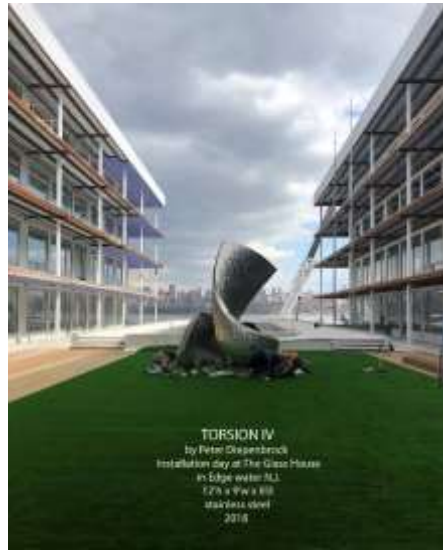
Torsion IV , Bridgewater N.J. 2018