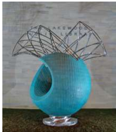
Transversion , Lakewood, Ohio. 2011