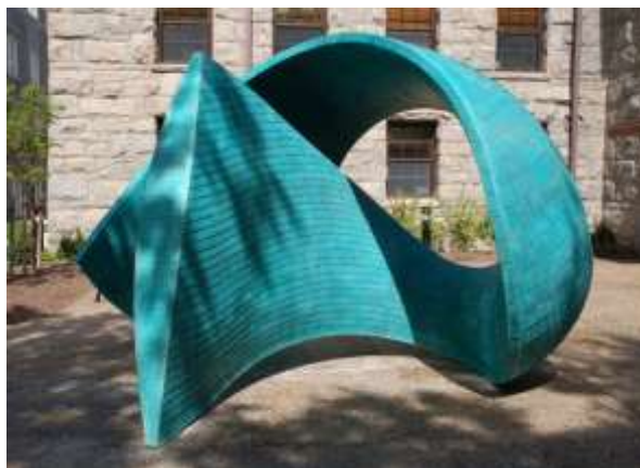
Torsion III , University of Rhode Island. 2009